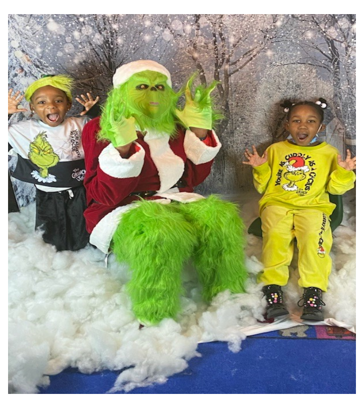
We're scared of the Grinch!