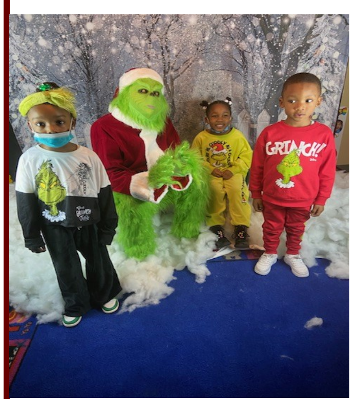
We have our eyes on The Grinch.