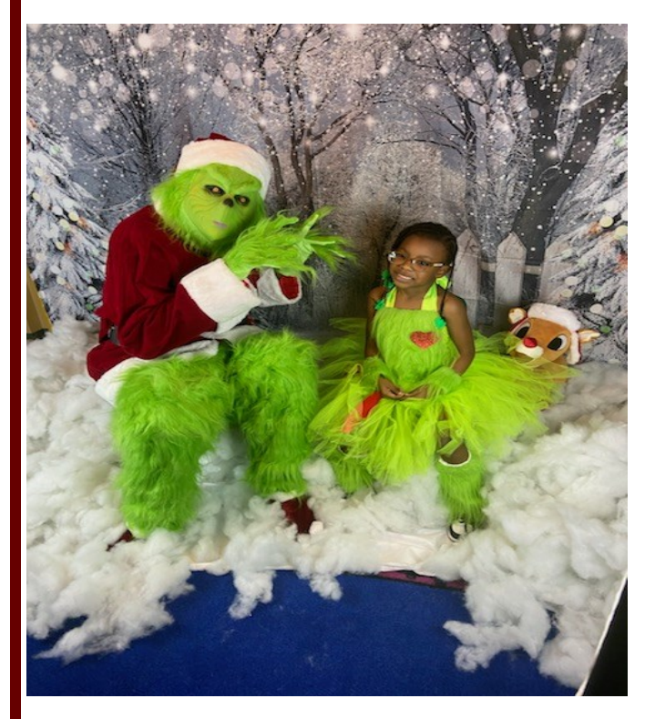
I'm not scared of the Grinch!