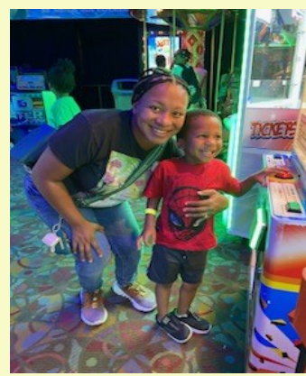
I love having Mom with me.