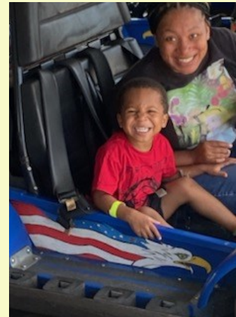
The go-carts are fun