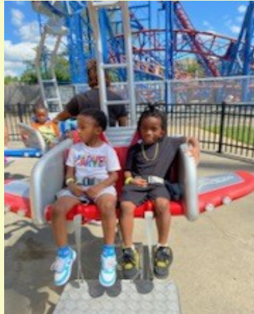
We're waiting for it to start.