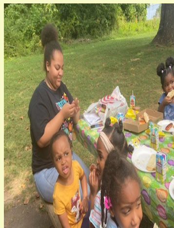
The kids say the food is good.