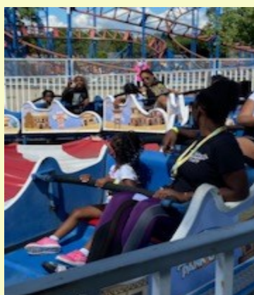
Mom & I are on the ride.