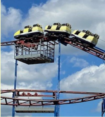
The fun roller coaster.

Our 2023 summer trip program was a great success. Our children enjoyed bowling, the movies, Sky Zone, Main Event, Chuck E Cheese, Hyper Kidz, National Aquarium, Adventure Park USA, Kidz Jungle World, and the picnic at Northwest Regional Park. Thanks is extended to parents who allowed their child to participate in the summer trips and a special thanks to parents who served as chaperones. Our last two trips were to Adventure Park USA and Northwest Regional Park. Please see pictures below: